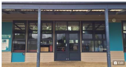
Room 5 MPS 2019 ~ Secret group · 13 Members

Room 5 families have their own Facebook Secret group! You have had a note and those who sent email details have been invited (please check junk folder if you haven't received yours). It is a great way to keep up-to-date with your child's activities at school.