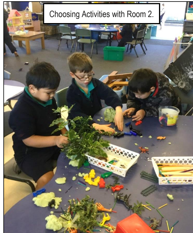
Choosing Activities with Room 2.

PLEASE REMEMBER TO CALL/TEXT THE OFFICE IF STUDENTS ARE GOING TO BE AWAY. 027 711 9021 ALL LATE STUDENTS MUST COME TO THE OFFICE FOR A LATE STAMP, PLEASE DO NOT BE LATE! SCHOOL STARTS AT 8.45am