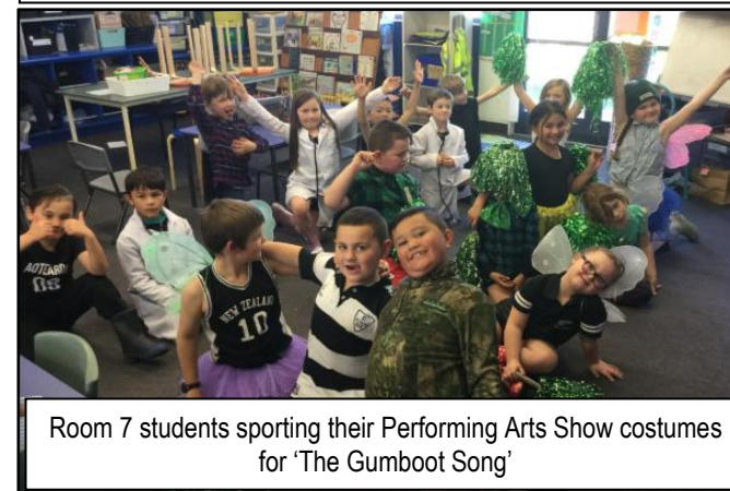
Room 7 students sporting their Performing Arts Show costumes for 'The Gumboot Song'